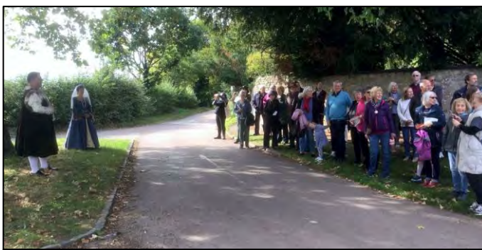
Henry VIII and Anne Boleyn await the arrival of Cardinals Wolsey and Campeggio, who will report that the Pope will not annul Henry's marriage to Katherine of Aragon.