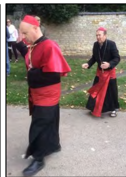
Cardinals Wolsey and Campeggio