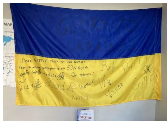
This 'Thank You' has recently arrived from soldiers in the front line!!

If you, or any of your friends, family and contacts are able to contribute supplies - bandages, Tenna pads, sanitary products, disposable nappies and even soap and other cleansing products such as creams, please let me know and I will collect them from you. Sadly, we cannot collect and despatch prescription only items. Also, there is a new and urgent appeal for medical aids such as walking sticks,