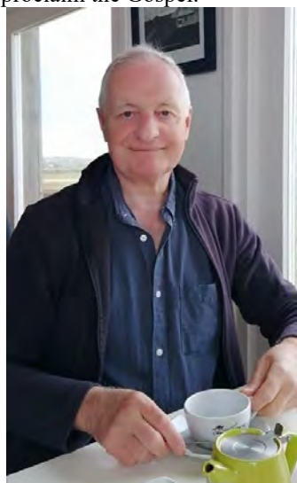
Always time for a coffee.